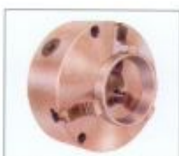
SPECIAL PURPOSE CHUCKS