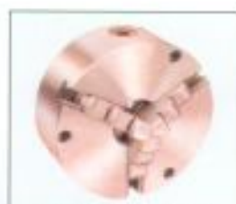
3 JAWS SELF CENTERING TRUE CHUCKS