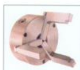
SPECIAL PURPOSE CHUCKS