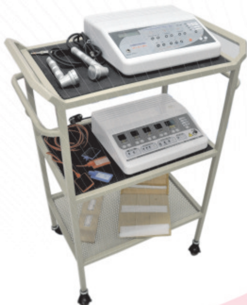
Different Sizes of Applicator Heads